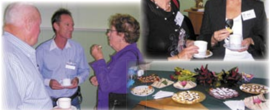
Meeting other new residents at the June 'Welcome to Buderim' afternoon tea