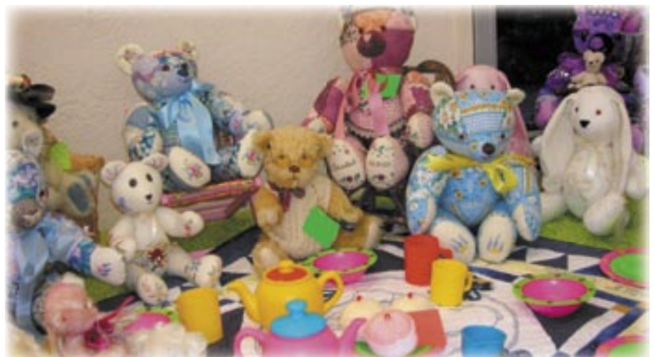
'Pens & Needles' Exhibition at Craft Cottage in May