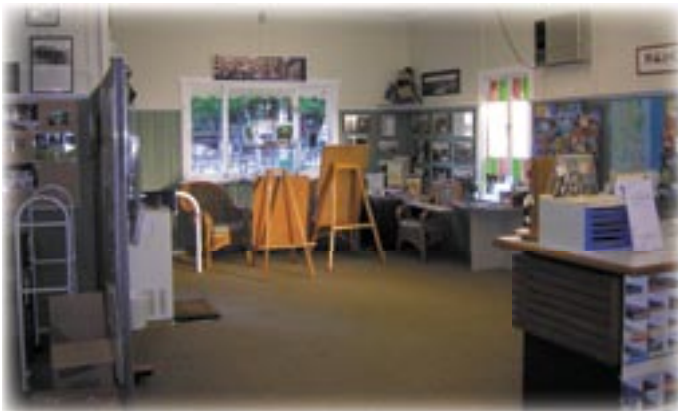
The OPO interior renovations - before - during - and after