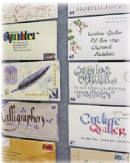
Colourful calligraphy work at the 'Pens & Needles' Exhibition at Craft Cottage in May

A bus load of members will be travelling to Toowoomba for their Flower Festival in September and we