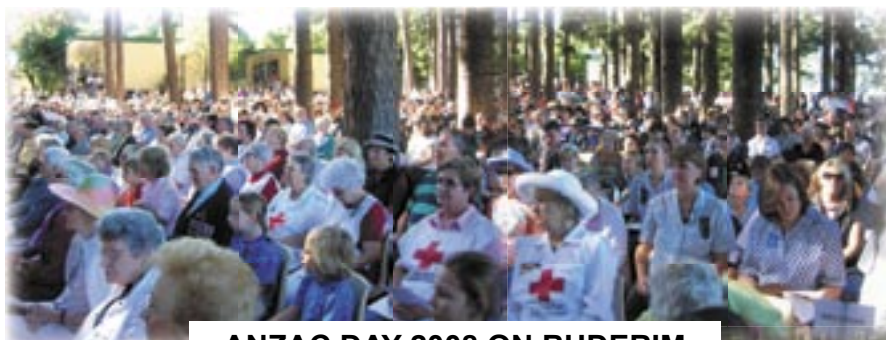
ANZAC DAY 2008 ON BUDERIM

◆ ◆ ◆ ◆ Service to Commemorate Sacrifice ◆ ◆ ◆ ◆