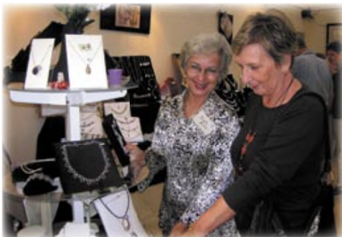
Individual hand crafted jewelery for sale at the Silversmiths Expo at Craft Cottage in May