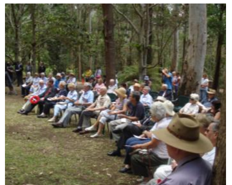
Remembrance Day service in Foote Sanctuary