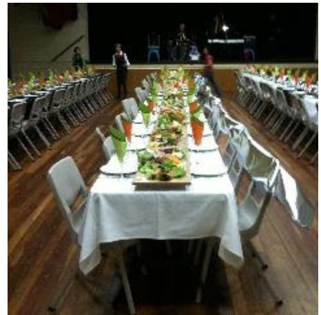
The Long Lunch in Buderim