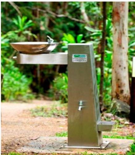
The new water bubbler in Foote Sanctuary Installed thanks to a 2009 Buderim Foundation grant