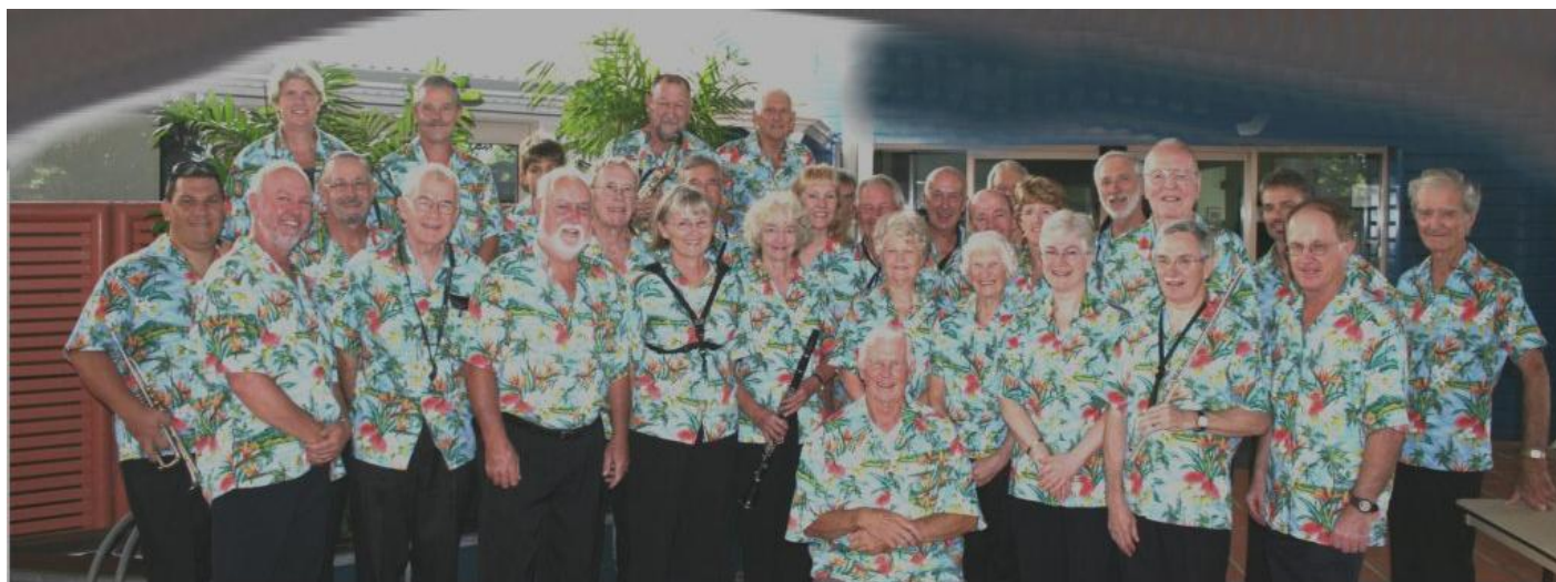
Sunshine Coast Concert Band members