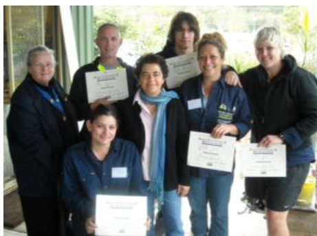
Toastmaster's Speechcraft graduates. Report p7