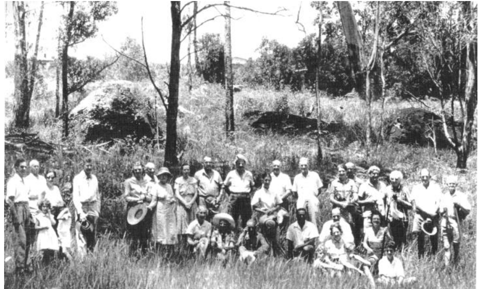
The pioneer working group of the Foote Sanctuary. They would be amazed to see it as it is today with its picnic areas, sealed walkways, water bubbler and beautiful signage.