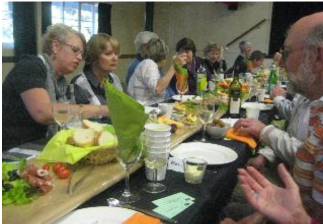
Scenes from the Friends of Buderim's Long Lunch which raised over $4000 towards renovating the Hall toilets.