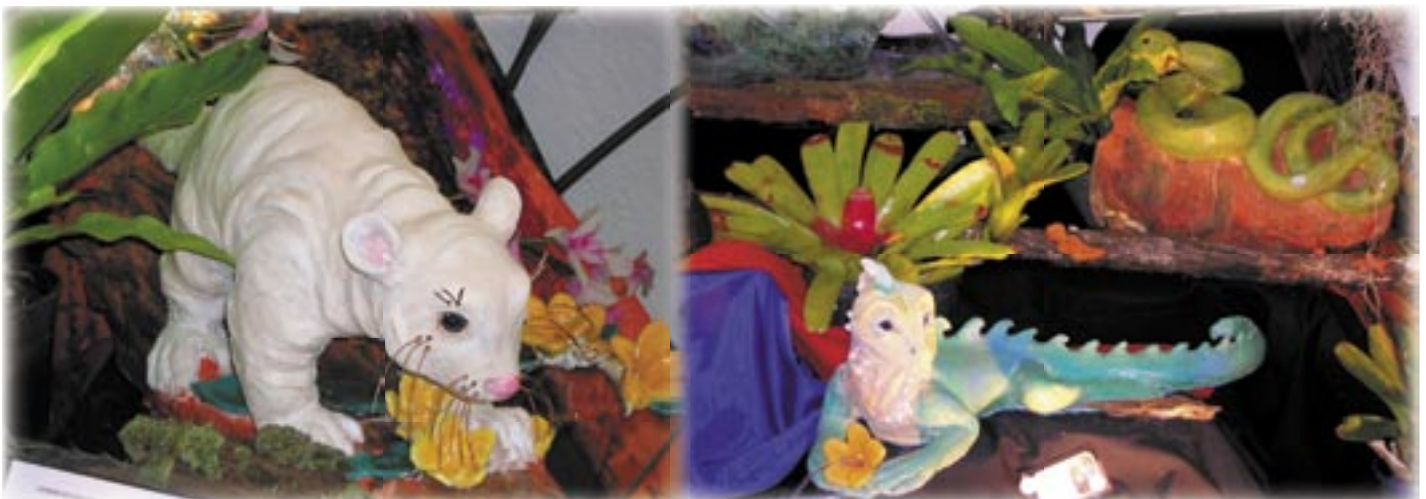
The Sculptured Garden Exhibition at Craft Cottage - Secrets of a world that goes beyond anything we have ever imagined are living in tropical Australian rainforests