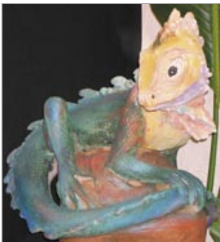
A clay sculpture of one of the unique animals that live in the tropical rainforests of Australia