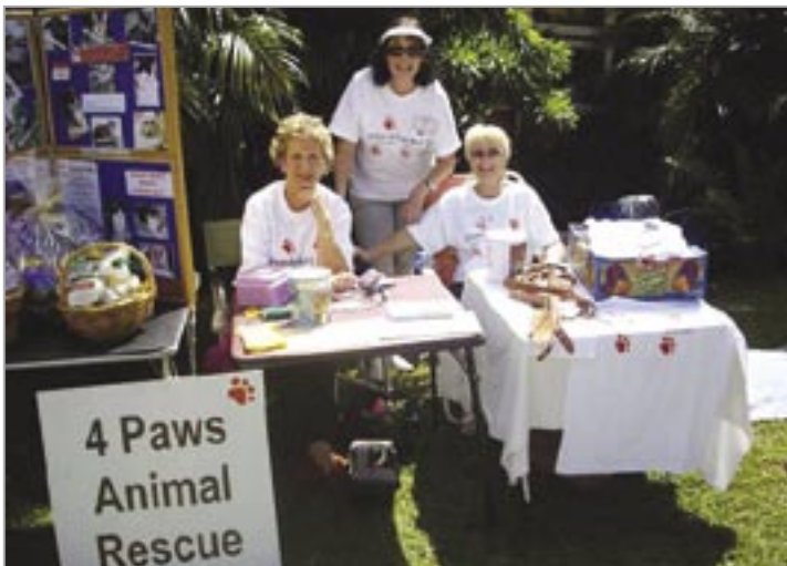
4 Paws Animal Rescue stall will be back at the Christmas Markets on 29 November