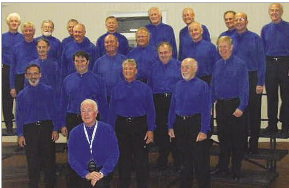
Sunshine Statesmen Barbershop Chorus members prepare for another concert