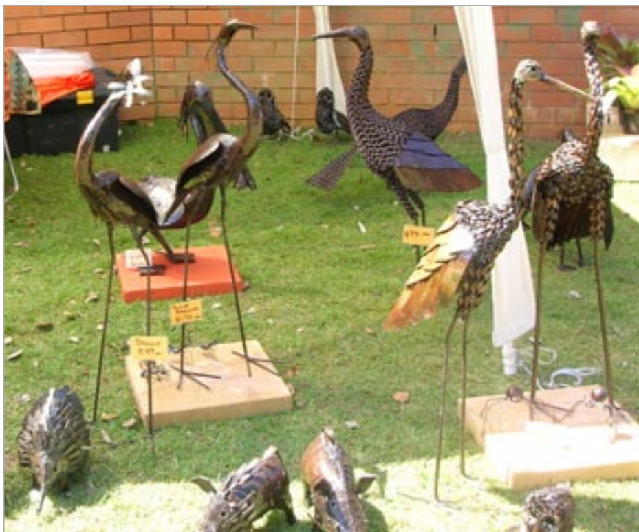
Some of the unusual creatures 'grazing' on the village green during the Spring Garden Festival in September