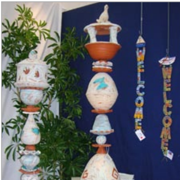
The Sculptured Garden Exhibition at Craft Cottage showed works by local artists which were considered world class by some visitors.