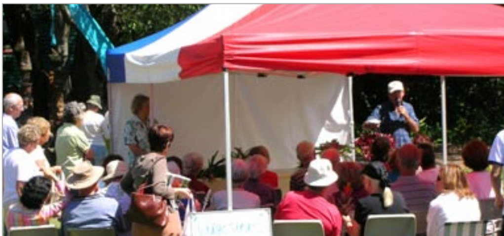
Workshops and practical demonstrations were an added feature at the Spring Garden Festival in September