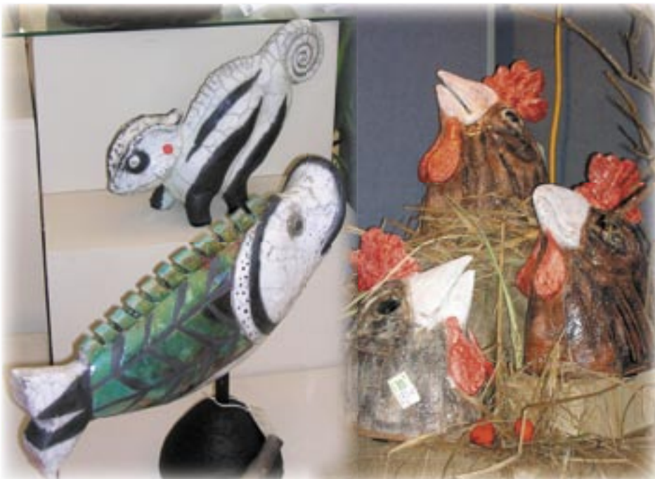
The Sculptures Garden Exhibition displayed a wide diversity of clay sculptures styles