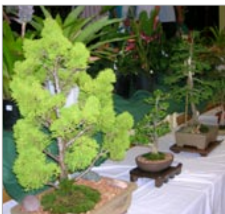
Bonsai - Gardens in miniature on display at the Spring Garden Festival in September