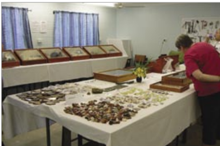
A section of the Gem & Fossicking Club Open Day display in September

The past three months have been as busy as ever for this popular Community Band. They have held two successful concerts; one at Beerwah for Seniors’ Week, the other in conjunction with Maroochy Rotary in the beautiful Maroochy Botanic Garden. The latter was held on Fathers’ Day and we were lucky to have a particularly beautiful Spring day which made a very pleasant afternoon for the many Dads who were there. With a variety of music and three talented vocalists, as well as the Band’s solo performers, the audience was treated to an afternoon of great music with a fun finale of ABBA hits.