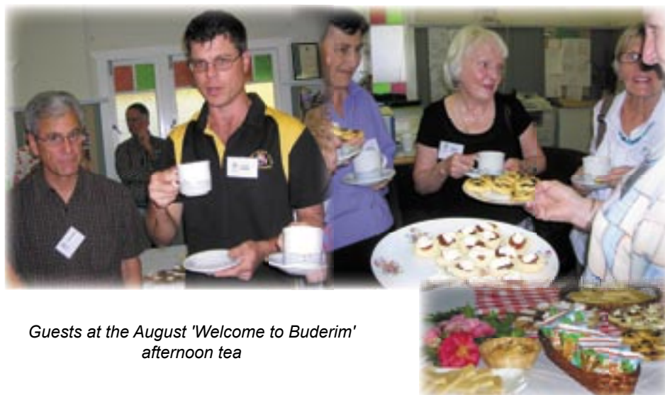
Guests at the August 'Welcome to Buderim' afternoon tea