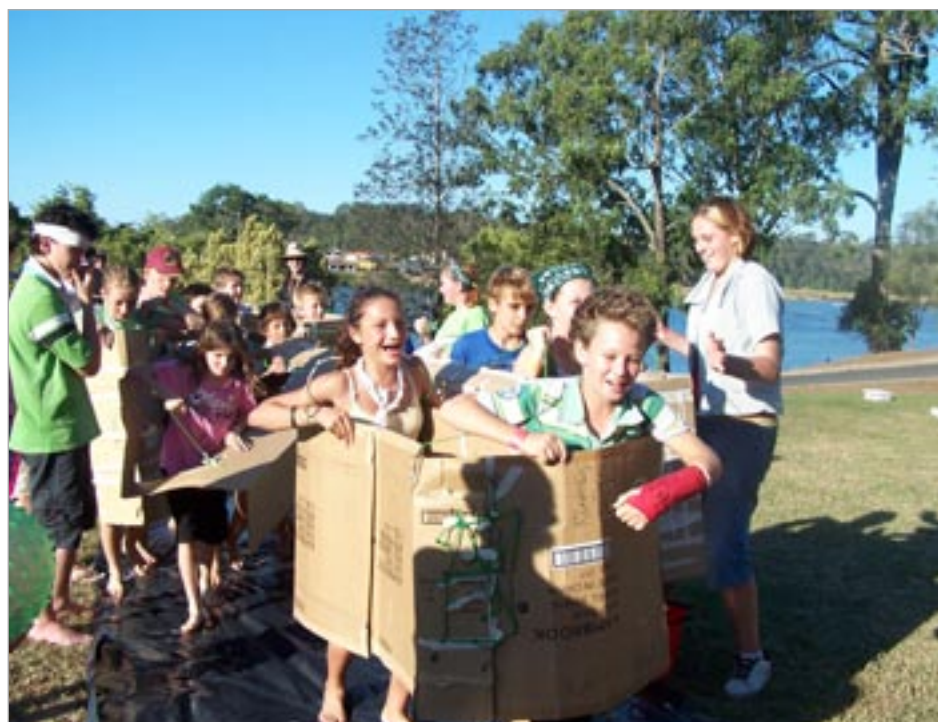
Young people enjoying fun and activity at a recent Fusion Youth Adventure Daytrip