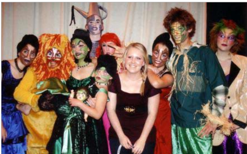
The Wizard of Oz

Although the men had joined the chorus mainly for the enjoyment of singing unaccompanied four-part harmony, their recent successful concert had enabled the group to make a very significant donation to the Cittamani Hospice Service.