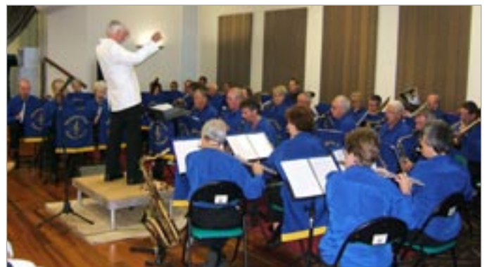
The SC Concert Band at a recent charity concert