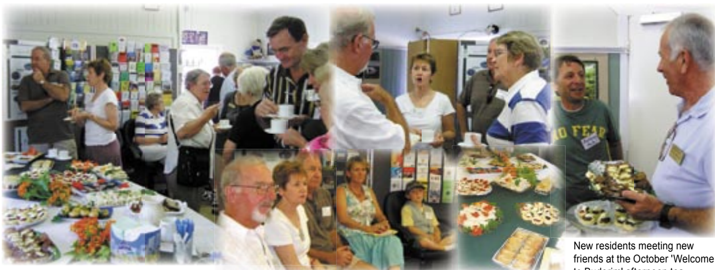
New residents meeting new friends at the October 'Welcome to Buderim' afternoon tea